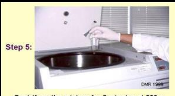
Centrifuge the mixture for 5 minutes at 500 g (~2000rpm).