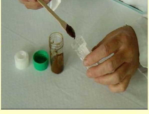
Emulsify 0.5-1 g of stool in 7 ml of 10% formalin in a tube.