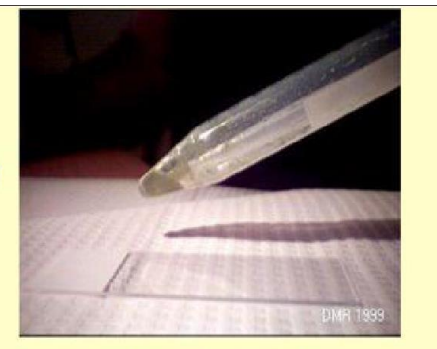
Mix the sediment well